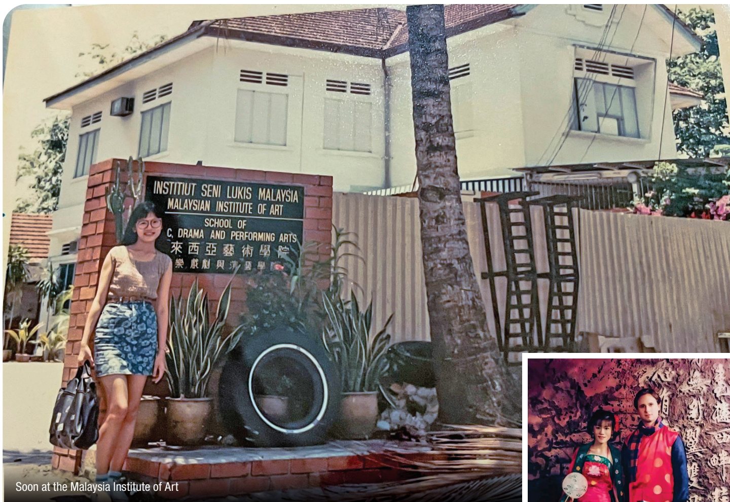
Soon at the Malaysia Institute of Art