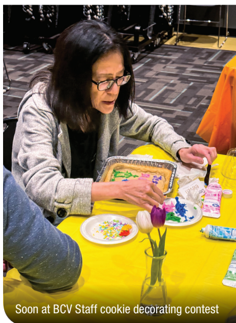
Soon at BCV Staff cookie decorating contest

"What a Friend We Have in Jesus" is a timeless hymn that has touched the hearts of countless believers. Many of us recall sitting in church, nestled between our parents and siblings, voices united in the familiar refrain: "What a friend we have in Jesus, all our sins and griefs to bear." Over the years, these words become like a soothing balm—familiar, comforting, yet perhaps a little too routine.