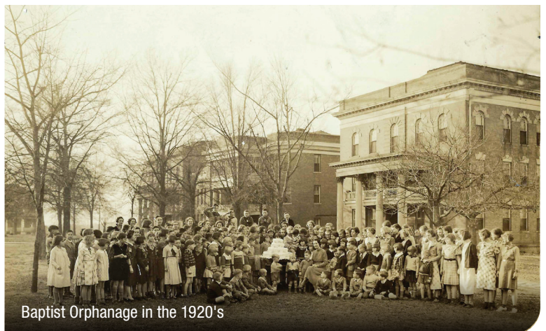
Baptist Orphanage in the 1920's