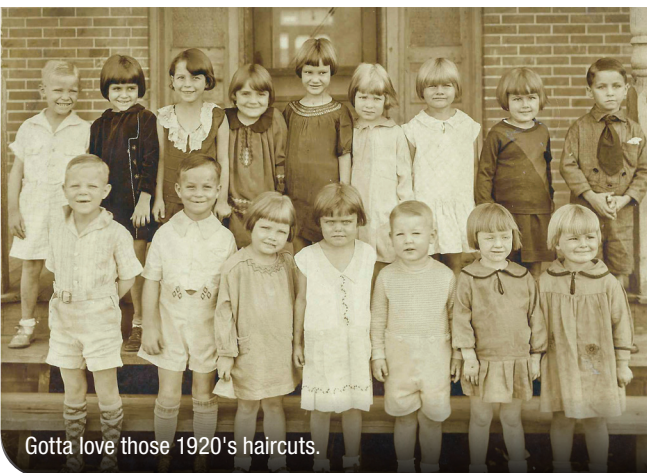
Gotta love those 1920's haircuts.