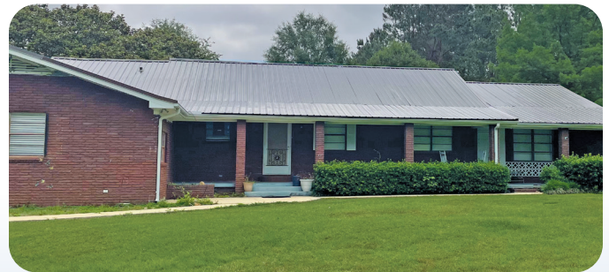
TOP: Moore Cottage BOTTOM: Nash Cottage